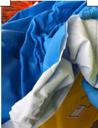
Single-use barrier wrap upon return to Sterile Service. Uncontaminated wraps are segregated for Sterimelt.