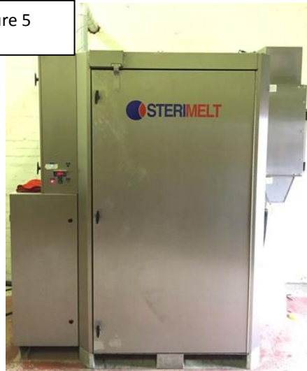
The wraps are heat densified during a 1.5 hour (approximate) cycle.