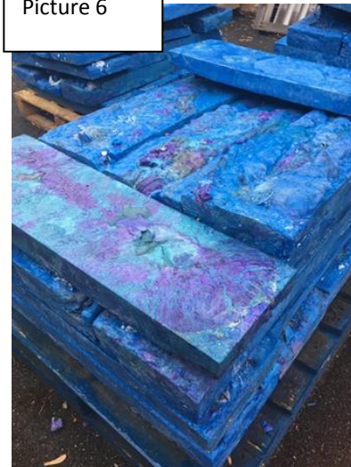
The process results in sterile, inert, briquettes.