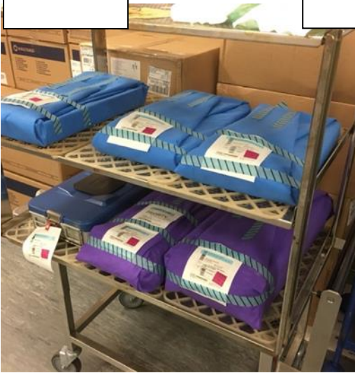
Instrument trays are wrapped in single-use barrier wrap prior to sterilisation. Once sterilised and quality checked, the trays are sent for use in Theatre.